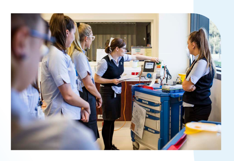
Our nurses and midwives will continue learning and developing through the Brookes Academy.