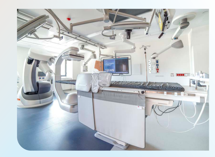
Our new hybrid theatre at Epworth Eastern.