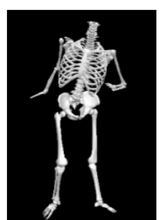
3DMA replicated skeleton