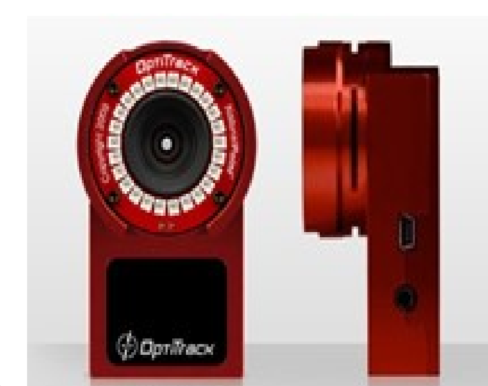
OptiTrack 3DMA cameras